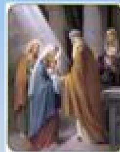
Finding in the Temple