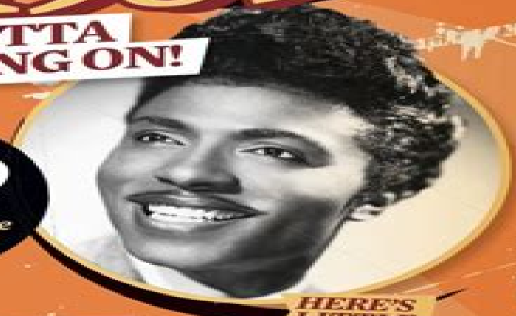
HERE'S LITTLE RICHARD Behind the scenes of a rock'n'roll classic