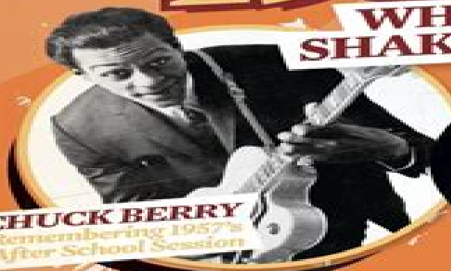
CHUCK BERRY Remembering 1957's After School Session