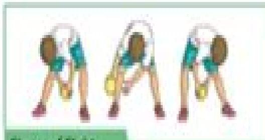
Figure of Eight

Try these different ball handling skills.