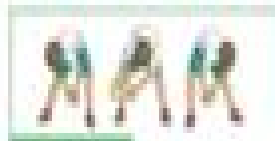
Figure of Eight

Try these different ball handling skills.