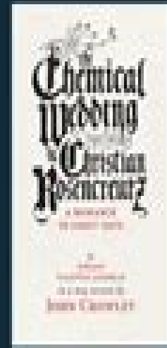
The Chemical Wedding , Johann Valentin Andreæ