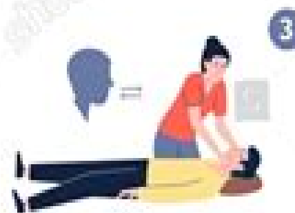
CHECK FOR BREATHING