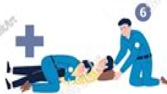
REPEAT UNTIL THE EMERGENCY SERVICES TAKE OVER