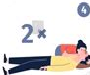
GIVE RESCUE BREATHS