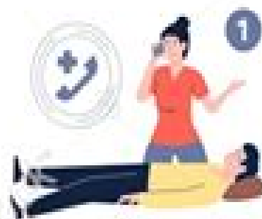
CALL FOR HELP