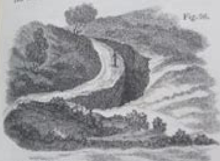
View from the hill of St. Agustin, near Soriano, in Cuba, looking south, and cut by the earthquake of 1811.

Formation of new lakes. —In the vicinity of Semino, a lake was suddenly formed by the opening of a great chasm, from the bottom of which water issued. The lake was called Lago del Toldo. It extended