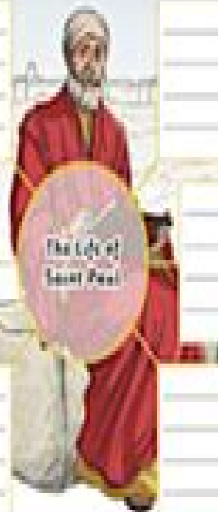
This image is a reproduction of a work of art. The image is not to be used for commercial purposes without the written permission of the artist or the publisher.

In the boxes below, write down everything that you know and have found out about the life of Saint Paul. Who was he? How did he achieve his mission?