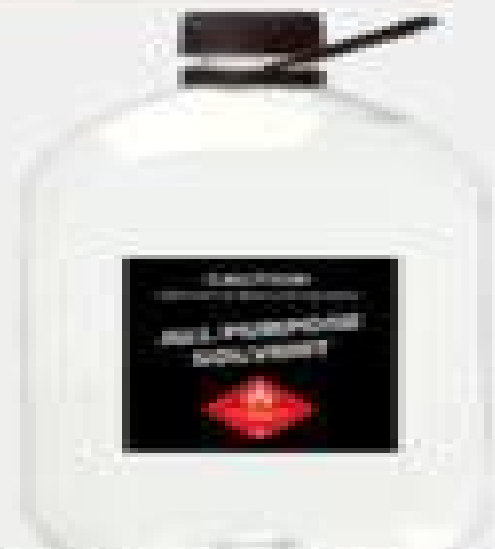
Solvents reduce the viscosity of paint formulations, improve application, and shorten drying times.

For example, today's trend is towards lower viscosity to reduce time required to dry, but also there is resistance when something is rolling due to reduced wet edge and the appearance of excessive brushstrokes and "orange-peeling" like appearance of a dried edge around the perimeter of a wall where the thickness of substrate coating, the roller applied coating.