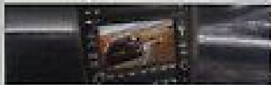
PCM Porsche Communication Module