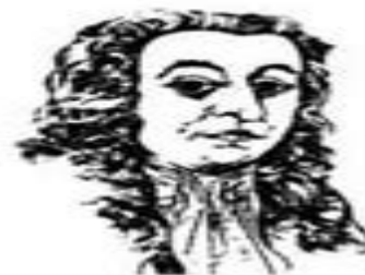
Robert Hooke (1660) Law of Solid Elasticity [Stress/Strain]

The Force↔Balanced Physics of the Earth's Sedimentary Crust is a new Field Theory that synthesizes the Physical Laws of the Greatest Mechanics of All Times.