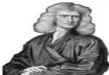
Isaac Newton (1666) Law of Universal Gravitation