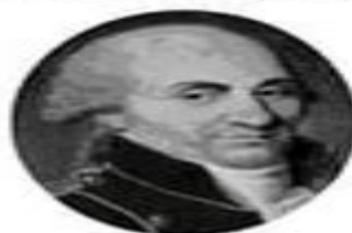
Charles Augustin Coulomb (1791) Law of Electrostatic Repulsion