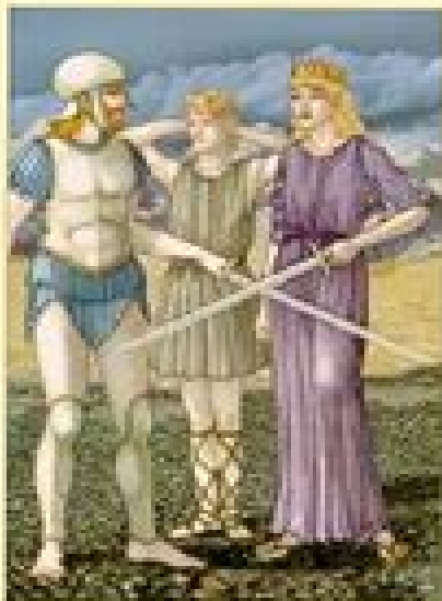
TWO OF SWORDS