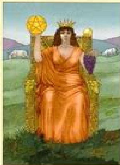
QUEEN OF PENTACLES