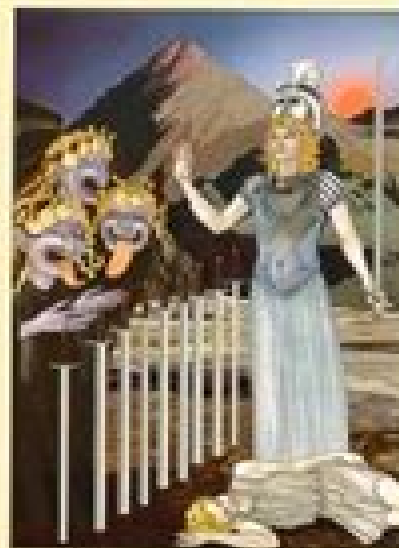
TEN OF SWORDS