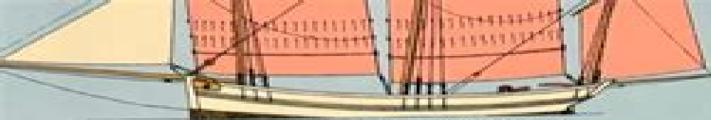
Thames sailing barge, an old type that still exists today.