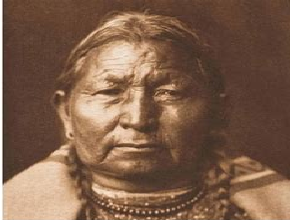
Edgewood (Cheyenne-Blackfoot), c. 1890