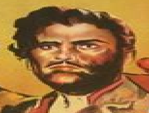
Arturo de CORDOVA (ALVARO)