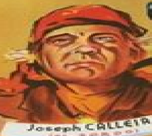
Joseph CALLEIA (EL SEÑOR)