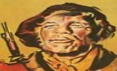
Valdimir SOKOLOFF (ALEXANDER)