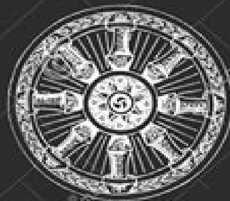
Wheel of Samsara