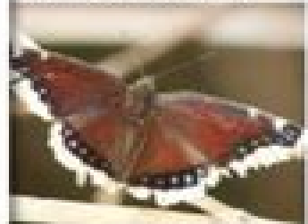
Mourning Cloak Butterfly