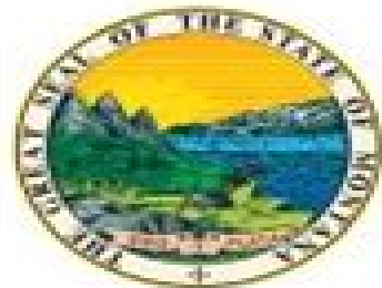
Montana state seal