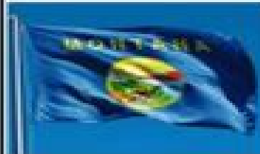
Montana state flag