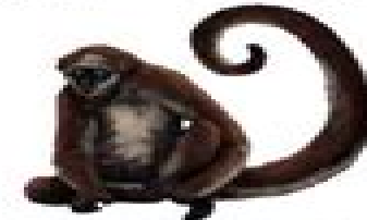
Black-handed Spider Monkey