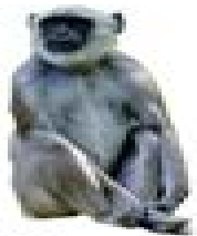
Northern Plains Gray Langur