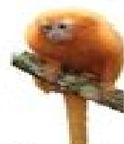
Black Lion Tamarin