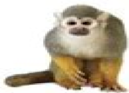
Central American Squirrel Monkey