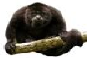
Mantled Howler Monkey