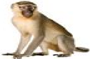
Common Squirrel Monkey