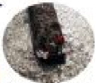
Agricultural non-point pollution