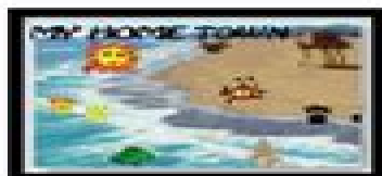
Figure 40a-d—Kindergarten projects

_____ You will complete many projects this year that require pre-keyboarding (Figures 40a-d):