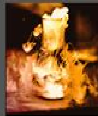
sodium in water