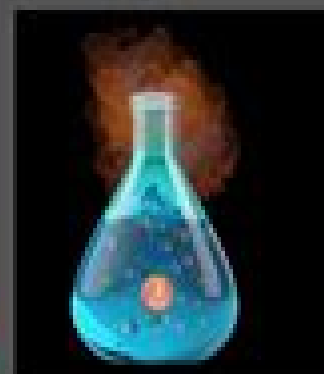
copper and nitric acid