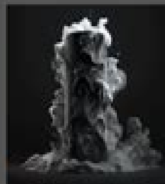
sugar and sulfuric acid