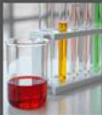
traffic light reaction