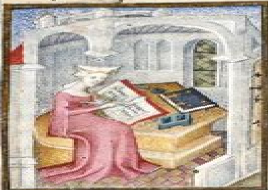
Le premier chapitre pule de la desayraon du corps de poliee

EDITED AND TRANSLATED BY Angus J. Kennedy