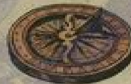
Pocket compass and sun dial.