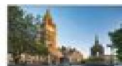
May Manchester Town Hall & Albert Square