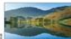
October Buttermere, Lake District