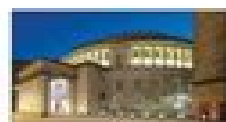
April Manchester Central Library