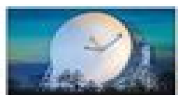
February Jodrell Bank