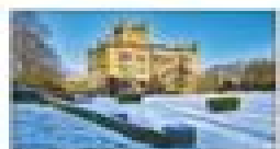
December Gainsborough Hall

ENVELOPE INCLUDED LARGE LETTER POSTAGE SIZE