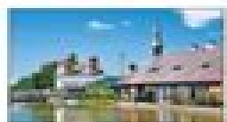
July Shropshire Union Canal