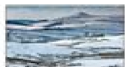
January Shuttlington, Peak District

The North West of England is a diverse region that includes areas of outstanding natural beauty, busy fishing ports, cities that pioneered the Industrial Revolution, and world-renowned seaside resorts. These twelve photographs capture much that this area has to offer.