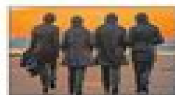
September Deans Station