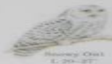
Snowy Owl L 20-27"