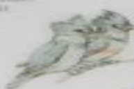
Belted Kingfisher L 13"