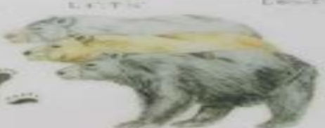
Black Bear L 5-6", SH 2-3"