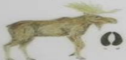
Moose SH 3-5"