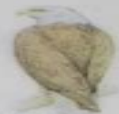
Bald Eagle L 30-43", W 7-8"