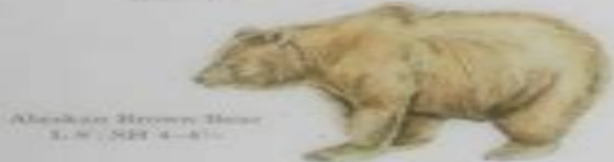
Alaskan Brown Bear L 6", SH 4-6"