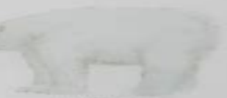
Polar Bear L 6-7"