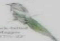
Black-bellied Magpie L 17"-22"