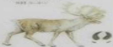
Caribou SH 3-5"