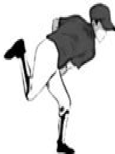
Lift Back Leg