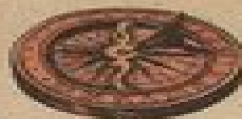
Pocket compass and sun dial