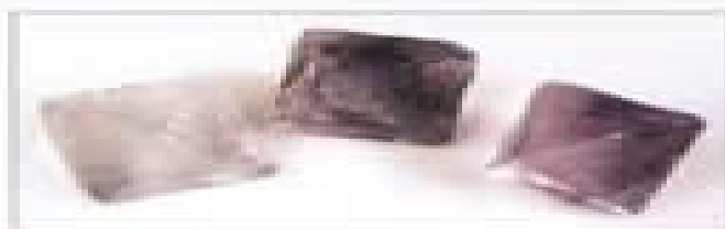
FLUORITE: Three fluorite cleavage cuttings from Cave-in-Rock. These fluorite Baomin came upon LWC (LW-acc. 0.8 inches-wide. Value $4-6 ea.)