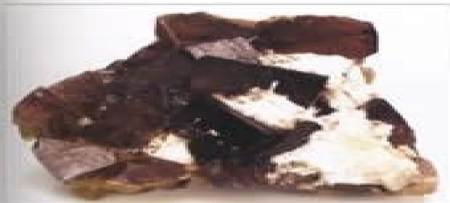
FLUORITE: A plate of purple fluorite crystals that Baomin came upon (LW) and LWC. From the Mine No. 8 mine, Cave-in-Rock, Miller County, IL. The company Elt Archer Co., came to the area in 1907 and discovered Baomin north of Cave-in-Rock. Mining started in November 1919. Countless small studies were made. Only three are in existence today. These are the Arsenal Lvs. the Denton, and the oldest, the Clark-Mohrman No. 1 (formerly called the Mine No. 1) (LW-acc. 4.0 is 5.5 inches. Value $150-200)