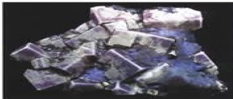
Same under UV