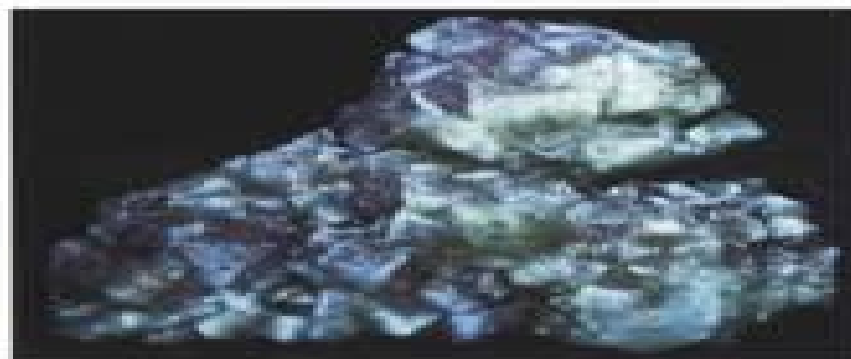
Same under UV