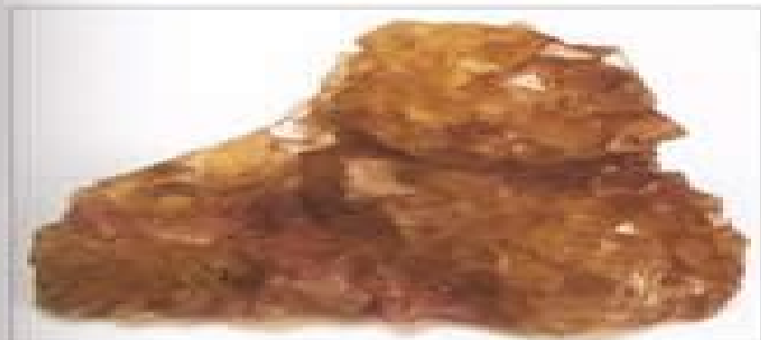
FLUORITE: A plate of amber-colored fluorite crystals from Cave-in-Rock. This fluorite Baomin came upon LWC (LW-acc. 5.3 is 4.0 is 1.0. Value $40-60)