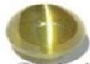
Chrysoberyl cats eye