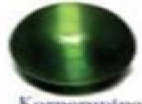
Kornerupine cats eye