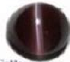
Sillimanite cats eye