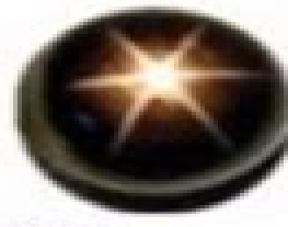
Golden star sapphire