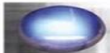
Blue moon stone