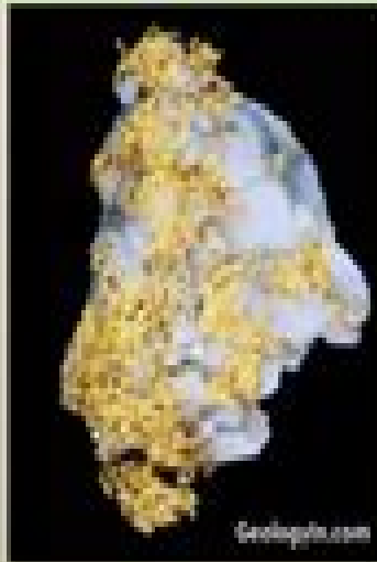
Native Elements - Gold