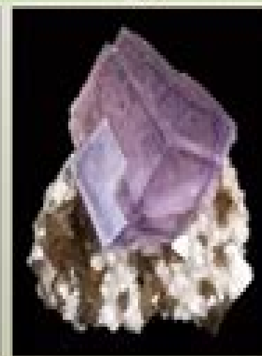
Halides - Fluorite