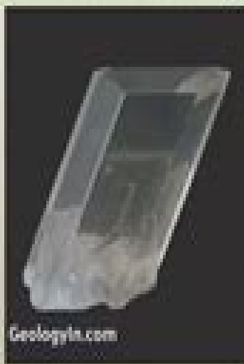
Sulfates - Gypsum