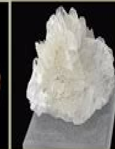
Borates - Colemanite