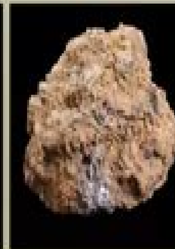
Nitrates - Nitratine