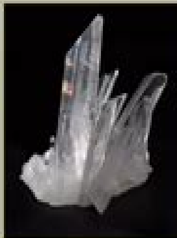
Carbonates - Calcite