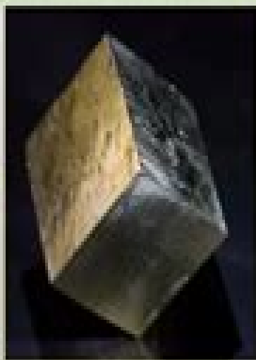
Sulfides - Pyrite