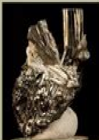
Hydroxides - Manganite