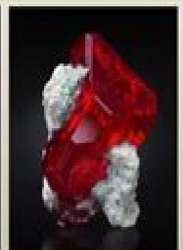
Oxides - Cuprite