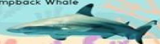
Blacktip Reef Shark