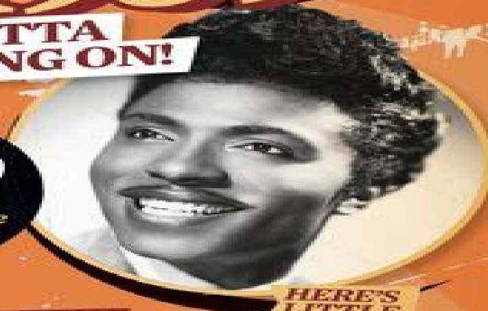
HERE'S LITTLE RICHARD Behind the scenes of a rock'n'roll classic

PLUS Carl Perkins ★ The Rock 'n Roll Trio ★ Billy Lee Riley ★ Cliff Richard ★ And more!