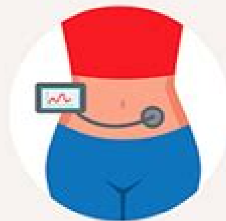
Blood Sugar Monitoring