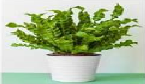
Bird's Nest Fern