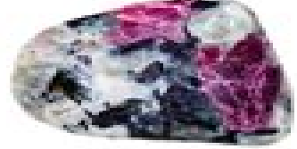
corundum in quartz