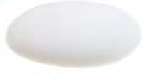
cacholong (white opal)