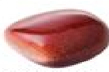
goldstone (aventurine glass)