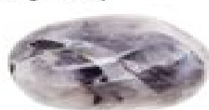
tamerlane stone (amethyst quartz)