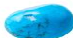
turquoise (blue howlite)