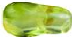
peridot (olivine, chrysolite)