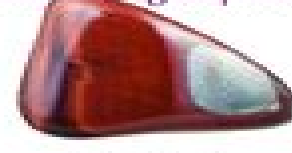
bull's eye (ox's eye)