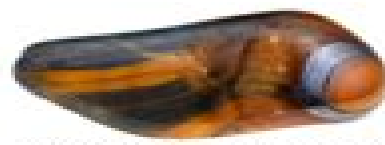
tigers-eye and hawks-eye