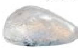
clear quartz (rock crystal)