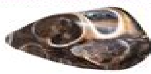
turitella agate (fossil jasper)