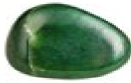
nephrite (green jade)