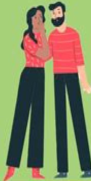
Body movements and posture