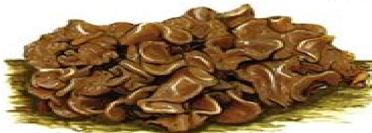
28. False Wood Ear Phaeotremella frondosa