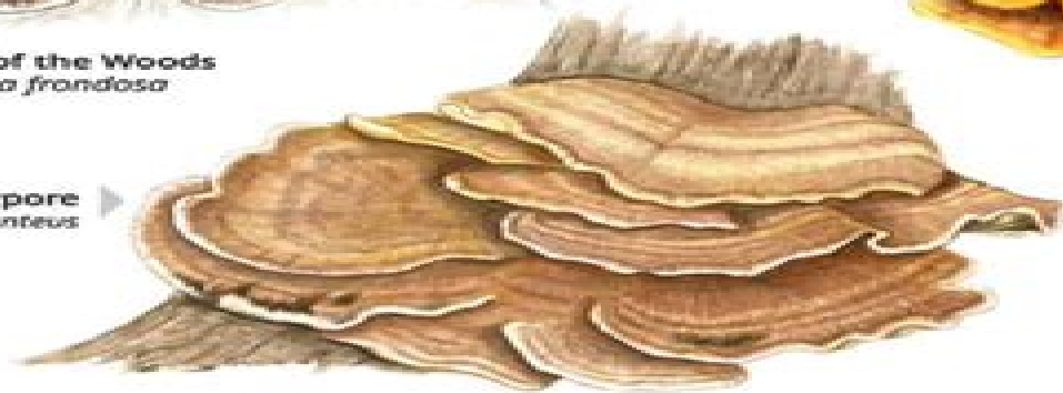
25. Giant Polypore Meripilus giganteus