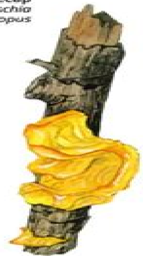
30. Yellow Brain Tremella mesenterica