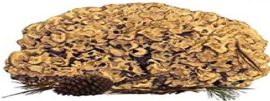
27. Wood Cauliflower Sparassis crispa