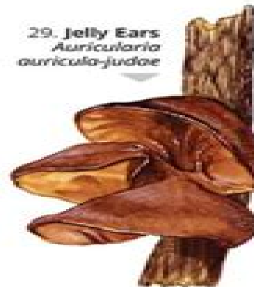
29. Jelly Ears Auricularia auricula-judae