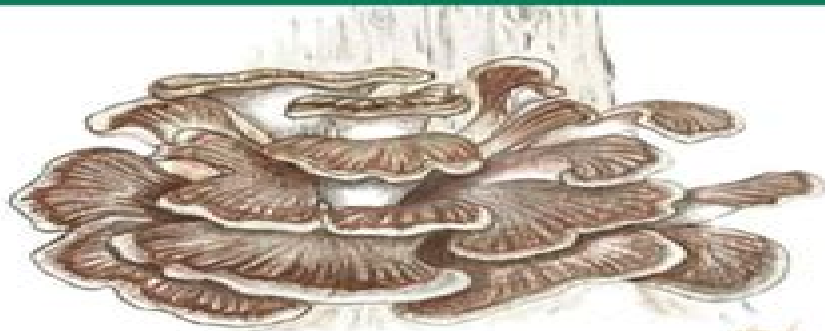
23. Hen of the Woods Grifola frondosa