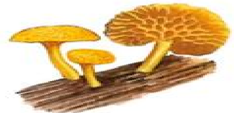
26. Orange Porecap Favolaschia claudopus