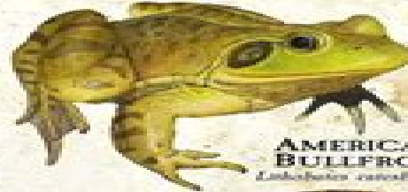
AMERICAN BULLFROG Lithobates catesbeianus