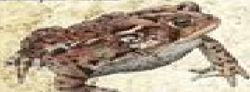
AMERICAN TOAD Anaxyrus americanus