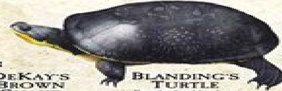
BLANDING'S TURTLE Emydoidea blandingii