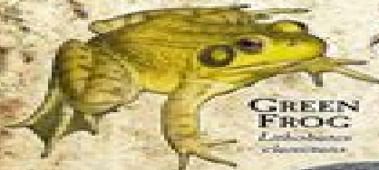
GREEN FROG Lithobates clamitans