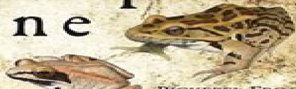
PICKEREL FROG Lithobates palustris