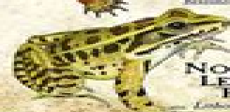
NORTHERN LEOPARD FROG Lithobates pipiens