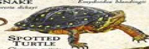
SPOTTED TURTLE Chelydra punctata