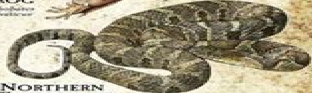
NORTHERN WATERSNAKE Nerodia sipedon