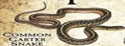
COMMON GARTER SNAKE Thamnophis sirtalis