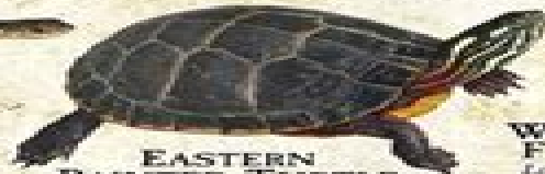
EASTERN PAINTED TURTLE Chrysemys picta picta