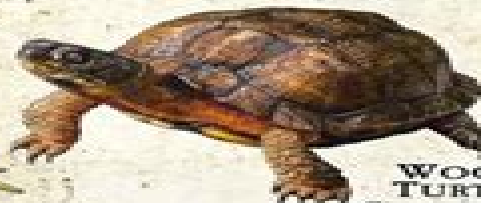
WOOD TURTLE Glyptemys insculpta