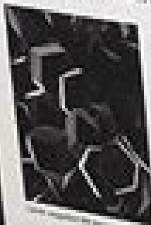
Micrograph of a plant structure.

MAGNIFICATION reveals a surprising, hidden world for all ages to explore.