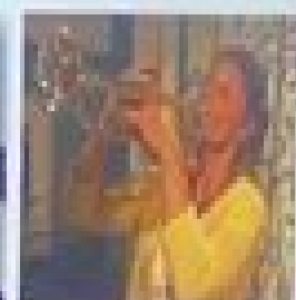
A Tuneful Toot on a Trumpet