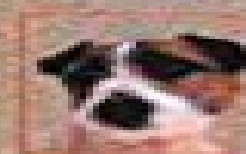
jack russell's terriers