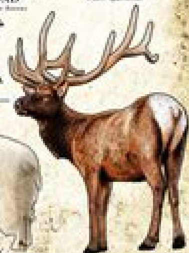
AMERICAN ELK Cervus canadensis

Rocky Mountain National Park is a treasure trove of wildlife. The park's diverse habitats, from alpine tundra to riparian forests, support a wide variety of plant and animal life. Many of the species found here are rare or endangered, making the park a critical refuge for them. Visitors can enjoy watching wildlife in their natural habitats, and the park's interpretive programs provide valuable information about the park's ecology and the role of wildlife in the ecosystem.