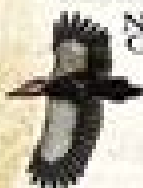
NORTHERN GOSHAWK Accipiter gentilis