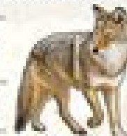
COYOTE Canis latrans