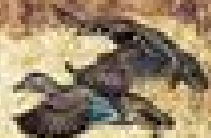
WOOD DUCKS Aix sponsa