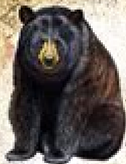
AMERICAN BLACK BEAR Ursus americanus