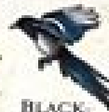
BLACK-BILLED MAGPIE Pica hudsonia