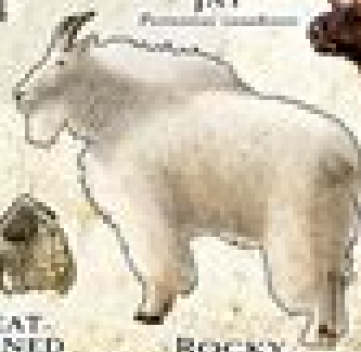
ROCKY MOUNTAIN GOAT Oreamnos americanus