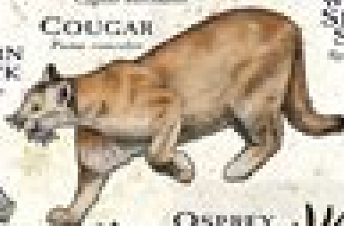
COUGAR Panthera concolor