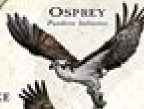
OSPREY Pandion haliaetus