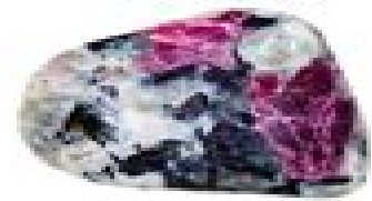
corundum in quartz