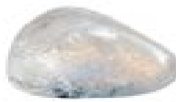
clear quartz (rock crystal)