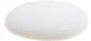
cacholong (white opal)