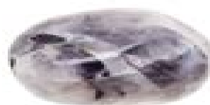
tamerlane stone (amethyst quartz)