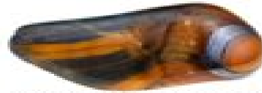
tigers-eye and hawks-eye