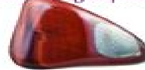
bull's eye (ox's eye)