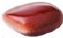
goldstone (aventurine glass)