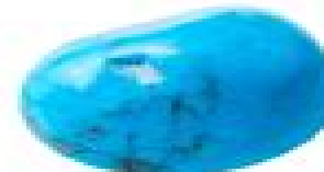
turquoise (blue howlite)