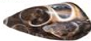
turitella agate (fossil jasper)