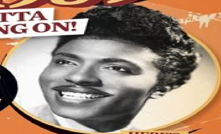
HERE'S LITTLE RICHARD Behind the scenes of a rock'n'roll classic

PAYOLA 1959 The scandal that rocked the music world