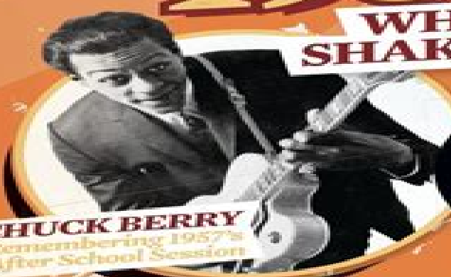
CHUCK BERRY Remembering 1957's After School Session

PAYOLA 1959 The scandal that rocked the music world