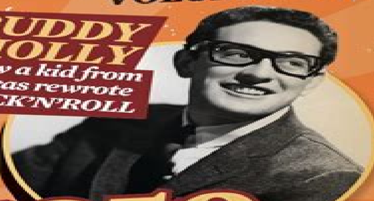
BUDDY HOLLY How a kid from Texas rewrote ROCK'N'ROLL