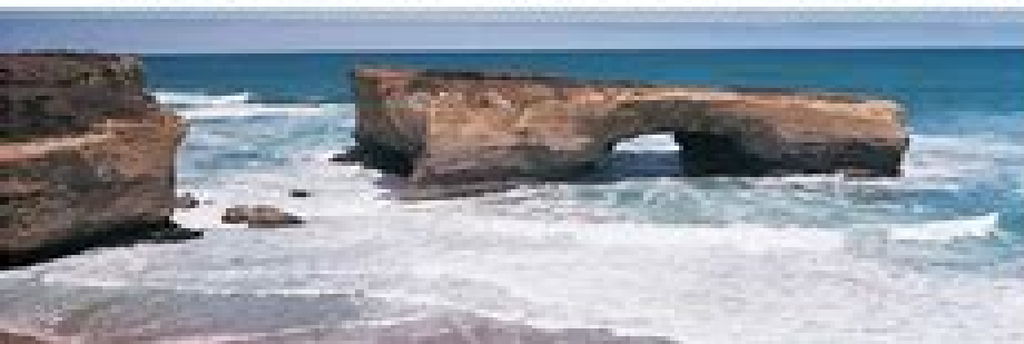
(d) Coastal erosion along Australia's southern coast produced a sea arch (left). Eventually, the bridge will collapse, and only sea stacks will remain (right). These two are among several that together are known locally as the Twelve Apostles.