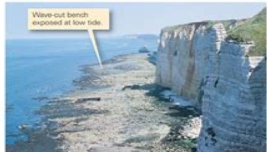
(b) A wave-cut bench at the foot of the cliffs at Etretat, France.