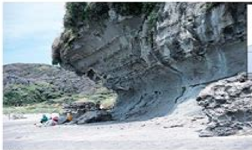
(a) A wave-cut notch.