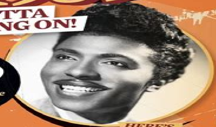
HERE'S LITTLE RICHARD Behind the scenes of a rock'n'roll classic