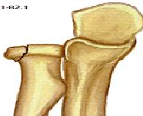
Simple fracture with minimal or no displacement