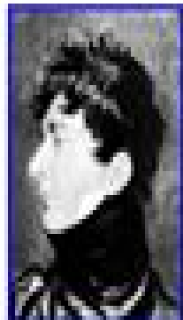
Portrait of the Hanoverian George IV, by Sir Allan Ramsay