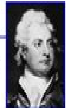
Portrait of the Hanoverian William IV, by Sir Allan Ramsay

king of United Kingdom reigned 1830–1837