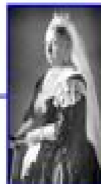
Portrait of the Hanoverian Victoria, by Sir Allan Ramsay

queen of United Kingdom reigned 1837–1901 [See House of Windsor]