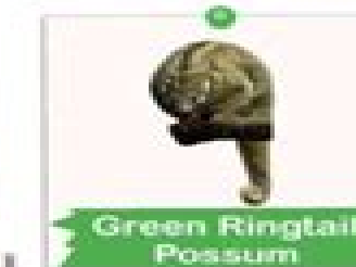
Green Ringtail Possum