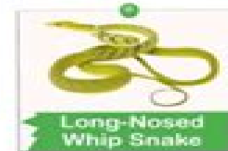
Long-Nosed Whip Snake