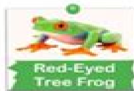
Red-Eyed Tree Frog