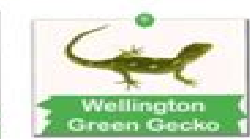
Wellington Green Gecko