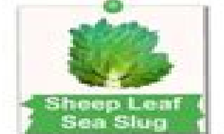
Sheep Leaf Sea Slug