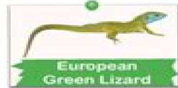
European Green Lizard