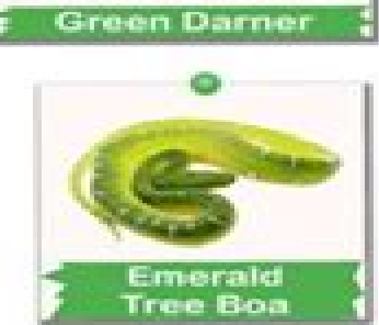
Emerald Tree Boa