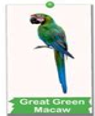
Great Green Macaw