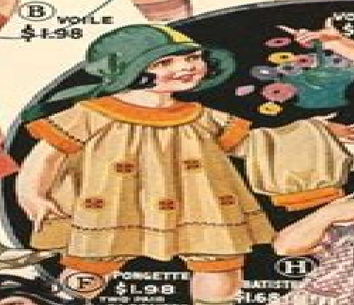
(B) VOILE $1.98