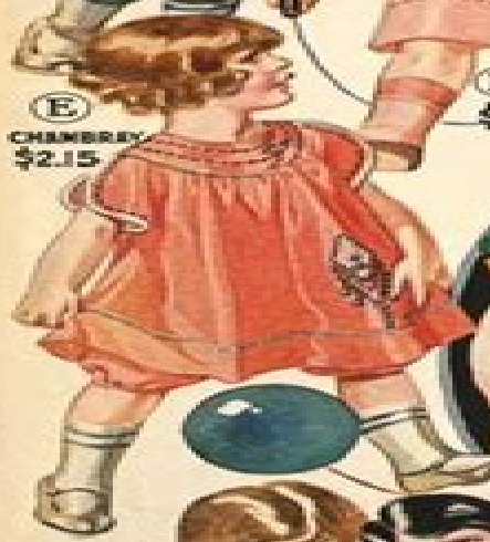
(E) CHAMBRAY $2.15