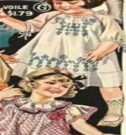
(G) VOILE $1.79