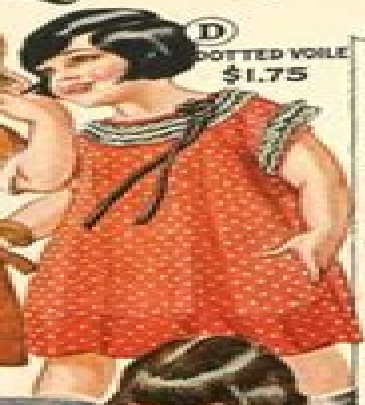
(D) DOTTED VOILE $1.75