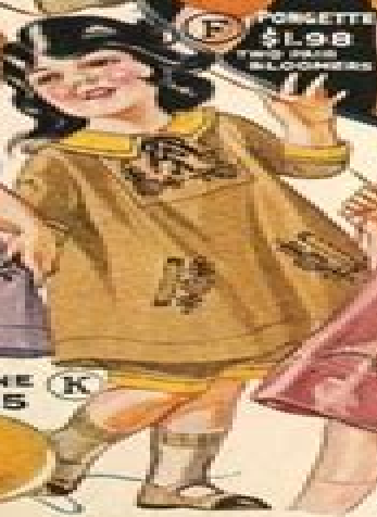
(F) FORGETTE $1.98