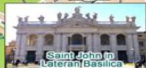
Saint John in Lateran Basilica