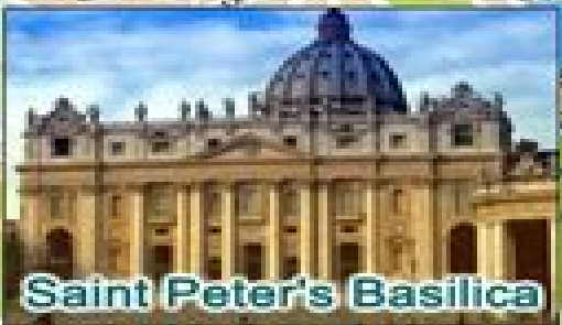
Saint Peter's Basilica