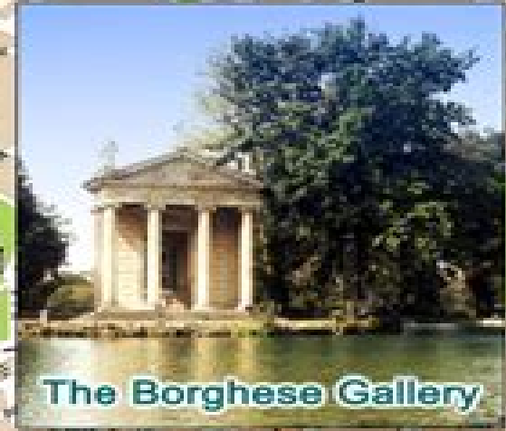
The Borghese Gallery